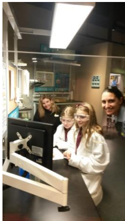
5 th grade students enjoyed a fun attraction at the Liberty Science Center.

On November 18, 2014, the 5 th grade students took a trip to the Liberty Science Center. The Liberty Science Center is like a museum, except instead of the no touching rule, the rule is touch everything! It is a center where kids get their hands dirty and experience amazing things. One of the exhibits the 5 th grade experienced was walking on beams above the museum. They were attached to a harness. It is fun yet terrifying! Another exhibit is a robot that solves rubric cubes. You mess up the rubric cube and then give it to the robot to solve the intricate puzzle. Another favorite is the Infinity Climber. It is a play space with 64 steps winding around it and it is also 34 feet off the ground. In addition, the students also had the opportunity to experience a hurricane in a simulator. The students appreciated the fun-filled science day.