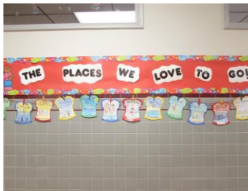
Vacation art projects featured in the first floor hallway.

Some of the many artists in our school have volunteered to display their personal art. The following work is only a small sample of the talent in our school. We may have the next Michelangelo among us.